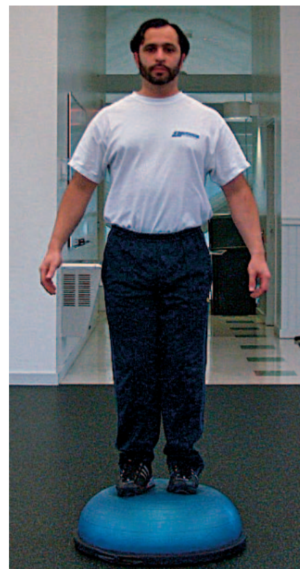
Figure 1. Double leg balance.

about hip-width apart or narrower, with knees flexed or "soft." Keep shoulders and hips parallel to the floor and with hands placed on the hips. A neutral spine