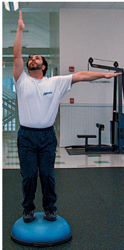
Figure 8. Visual tracking.

Performing head and arm movements (visual tracking) while maintaining a DLB position creates additional challenges to the visual sensory system. With arms at both sides, raise an arm to the side until it is parallel to the floor. Simultaneously raise the opposite arm from the side of the body forward while visually tracking the hand towards the ceiling. Follow the hand back to the side of the body to the DLB position (Figure 8). Perform the same maneuver using the opposite arm.