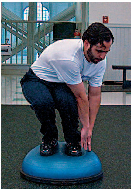
Figure 7. Squat twist.

the DLB position and slowly perform a squat twist (Figure 7) to one side of the body, touching the knees, shins, or ankles. The ability to remain stable, balanced, and in proper alignment determines the depth of the squat position while adding a twist. Proceed to the opposite side of the body in the DB squat twist.