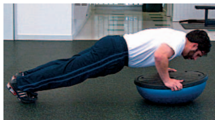
Figure 4. Platform push-up.

position should be maintained throughout the exercise. Little to no movement is desired as the body adapts to a centered position. Proprioception is further challenged and significantly improved when the eyes are closed while maintaining the centered position. Adding movement challenges the core, thereby increasing core strength, as well as strength to the ankles and feet. A simple rotation of the