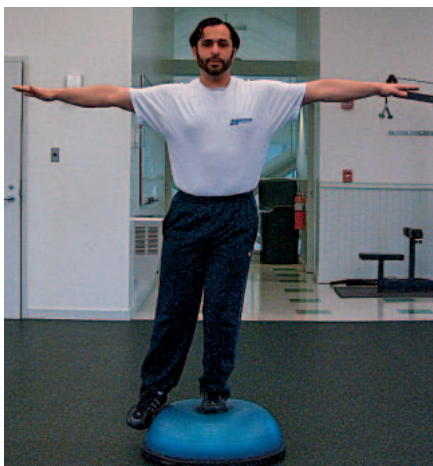
Figure 3. Single leg balance.

position should be maintained throughout the exercise. Little to no movement is desired as the body adapts to a centered position. Proprioception is further challenged and significantly improved when the eyes are closed while maintaining the centered position. Adding movement challenges the core, thereby increasing core strength, as well as strength to the ankles and feet. A simple rotation of the