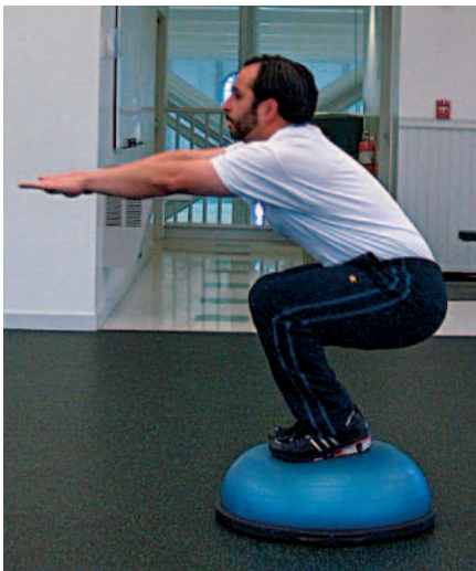
Figure 6. Squat.

Begin in the DLB position and slowly lower to a squat position (as low as is comfortable while maintaining stability). As the body lowers, raise the arms in front of the body to counterbalance the movement (Figure 6). For variation, return to