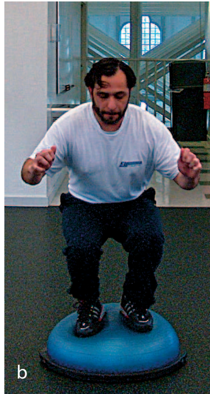
Figure 10a–b. Jump Stick.

ment, flex the lower body and extend upward using the arms to achieve clearance from the surface of the dome. Jump as high as possible while maintaining proper alignment and control. The landing or return requires soft knees and is not to be done straight legged. A “Jump-Stick” landing insures little movement in the body in order to resume balance (Figure 10a and b).