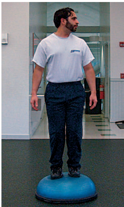
Figure 2. Double leg balance/head side-to-side.