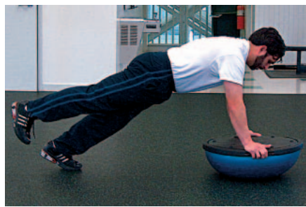
Figure 5. Front-leaning rest.

head from side to side, looking to the right then to the left with eyes open, improves the ability to maintain a stable centered position (Figure 2). For added difficulty, the eyes can be closed while the head is moving from side-to-side.