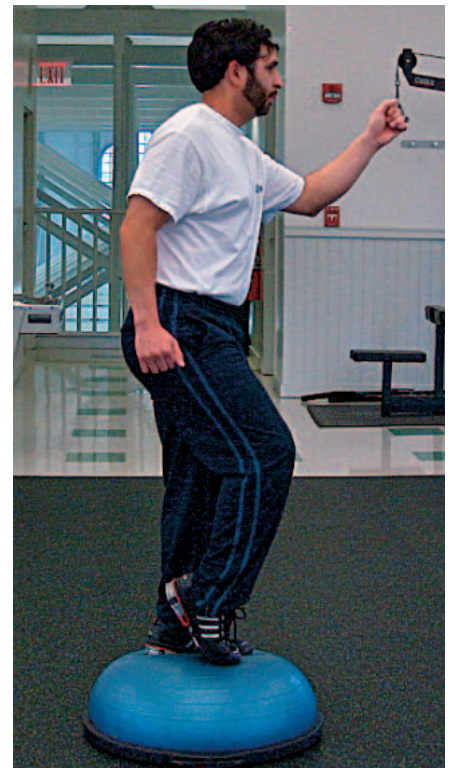
Figure 9. Walking/Marching.